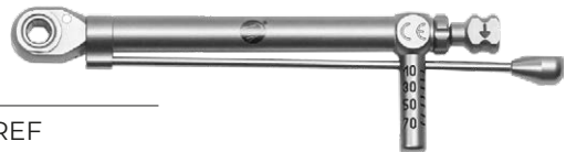
DYNAMOMETRIC RATCHET [ Inox ]