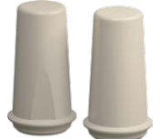
CASTABLE ABUTMENT SHOULDER [ Pmma ]