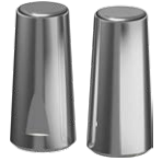
STRAIGHT ABUTMENT SHOULDERLESS [ Ti s ]