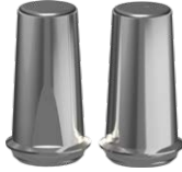
STRAIGHT ABUTMENT SHOULDER [ Ti s ]